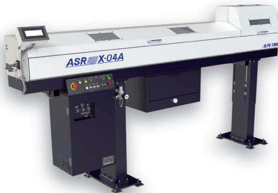
OIL TYPE MAGAZINE BAR FEEDER